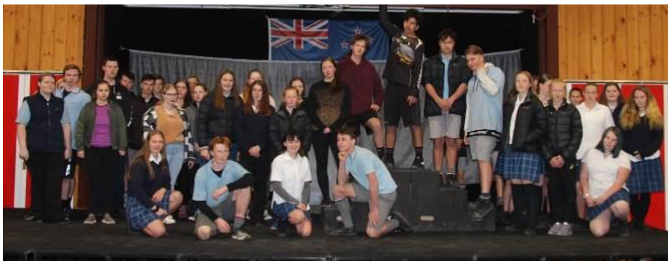
A practice for the Production.