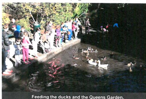
Feeding the ducks and the Queens Garden.

Parents & Caregivers are required to notify the YMCA of any absences, for any reason, as soon as possible. This will eliminate unnecessary concern and time in tracking your child's whereabouts. Parents & Caregivers are responsible for ensuring the YMCA has up to date contact and special care details.