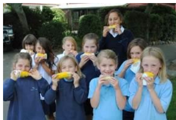
Students enjoying corn cobs from the school garden